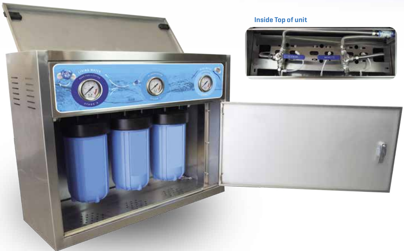
Inside Top of unit